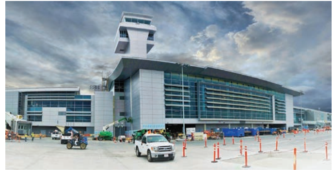
Los Angeles World Airport Midfield Satellite Concourse, Los Angeles

Capital has provided professional engineering consulting services throughout California and Northern Nevada since 1947. Over the past 7 decades, Capital has developed strong relationships with architects, owners, construction managers, and contractors involved in the design and construction of both air and ground transportation. Capital is very familiar with the unique challenges and broad impact that can occur with all transportation facilities projects.